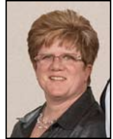
By Susan Clark Operations Coordinator

2 oz. Whole Butter 2 oz. All Purpose Flour 1 Qt. Heavy Cream 1/2 Cup Pecorino Romano Cheese, Plus 1 Tablespoon for Garnish Salt & Pepper to Taste 14 oz. Sliced Roasted Turkey Breast 2 Slices of Texas Toast (Crust Trimmed) 4 slices of Crispy Bacon 2 Roma Tomatoes, Sliced in Half Paprika, Parsley